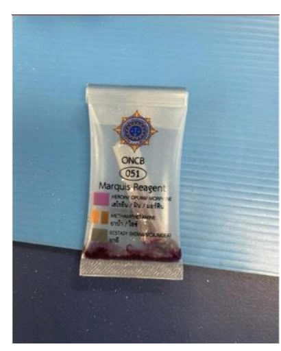
Drug Test Solution