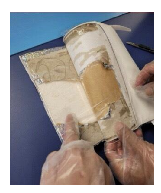
Heroin concealed in notebook's covers

They were put in two boxes for international postal parcel as express mail post. The sender and receiver appeared on the boxes were the same person. The boxes were sent from Samut Prakarn Post and Samrong Tai Post to be further sent to Australia. The AITF-Thailand conducted the investigation and seized them before going out to Australia. Thai and Australian authorities jointly extended the investigation of the case in order to identify the receiver at the end destination.