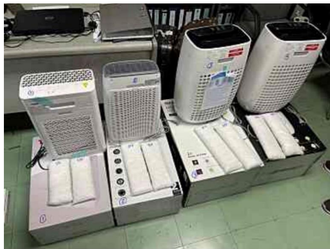
Ice concealed in air purifiers.

surveillance to their accommodation, a hotel in Aree Alley where they believed that more air purifiers concealing ICE like the ones they seized on 24 November 2020 should be kept in their room. Finally, on 3 December 2020, at 04.00 P.M., the AAITF arrested Mr. Niwat Jaitrong and Miss Kanoklak Thongprasri on 3 December 2020 when they came to the hotel and asked to enter the room. The authorities arrested the two suspects and inspected the air purifiers and found 8 kg of ICE. When the interrogation is finished, the suspects and evidence will be sent to NSB for proceedings.