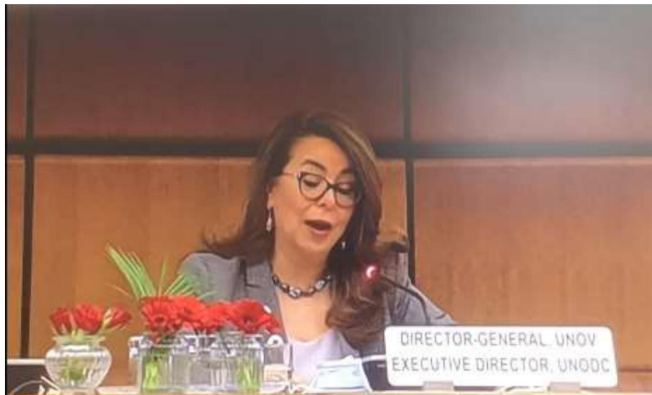
Ms. Ghada Waly, Executive Director of UNODC