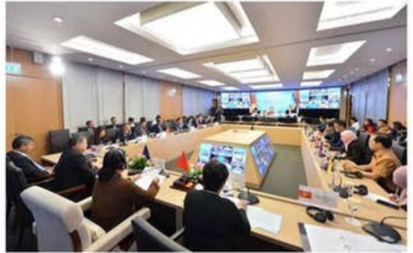
In the Meeting