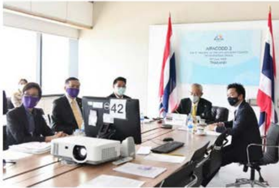
Delegation from Thailand (incl. ONCB)

The meeting adopted the resolution entitled “Turning Words into Actions Towards a Drug-Free ASEAN Community” which reaffirmed the disapproval of legalization of drug use for non-medical and scientific use and focused on the enhancement of drug control management in terms of supply, demand and harm reduction, the promotion of bilateral, regional and international cooperation through information sharing, cross-border cooperation, providing technical assistance and improving capacity to cope with drug issues in the region, especially in the post-COVID-19-pandemic, the development of legislation and strengthening the connection between AIPACODD with existing regional mechanisms on drug control.