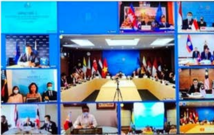
ASEAN Member States

The meeting shared and updated information on drug situation and control efforts in ASEAN region, particular the situation during the pandemic of COVID-19. In addition, Cambodia as the Chair of the 40th ASOD was invited to present the drug situation and control efforts in the region while UNODC was invited to share the information on the world and regional drug situation.