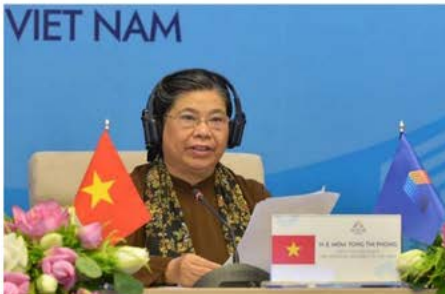
H.E. Madame Tong Thi Phong