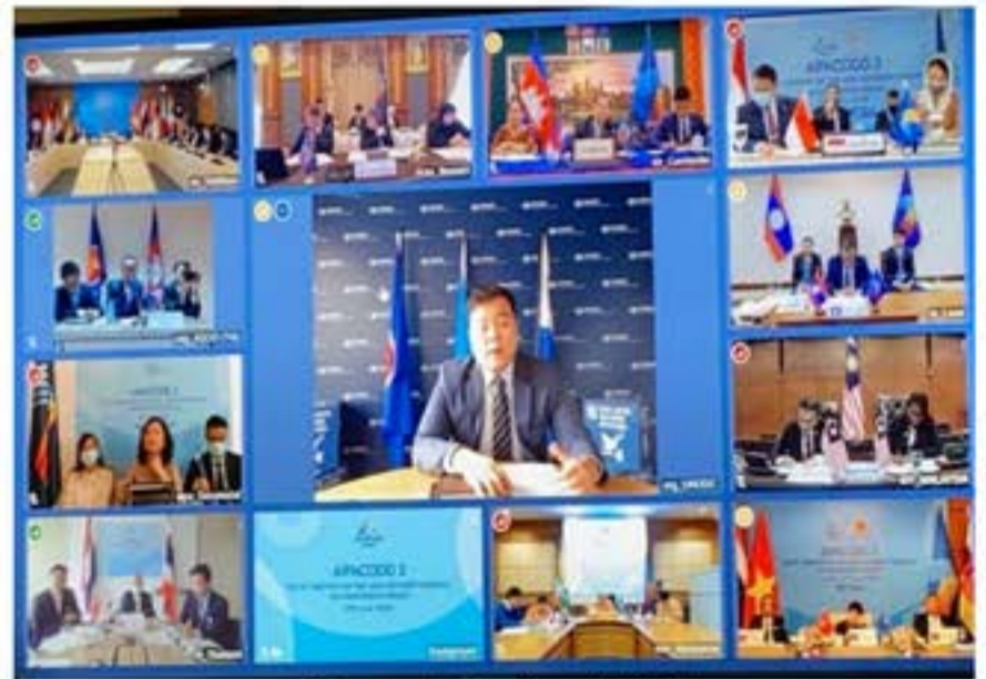
Representative from UNODC